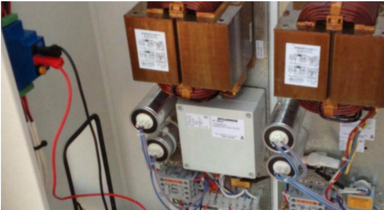
One of the dozen UBi installed on all DALI lines at Burpengary Regional SportsPark fields, clubhouse and amenities